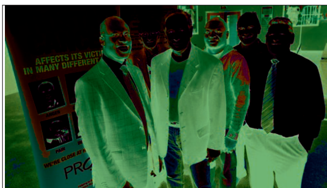
Expert urges men to take prostate cancer check-up

The focus of the event, was to raise awareness, with the emphasis on men with a family history of the disease and African-Caribbean men who have a three times higher risk.