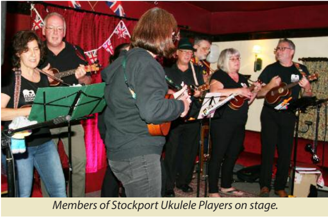
Members of Stockport Ukulele Players on stage.

Those are just some of the remarks of supporters who attended a ukulele based fun night in the Swan Inn, Dobcross, Saddleworth. The Swan has just been awarded the best venue in the Manchester Fringe Festival.